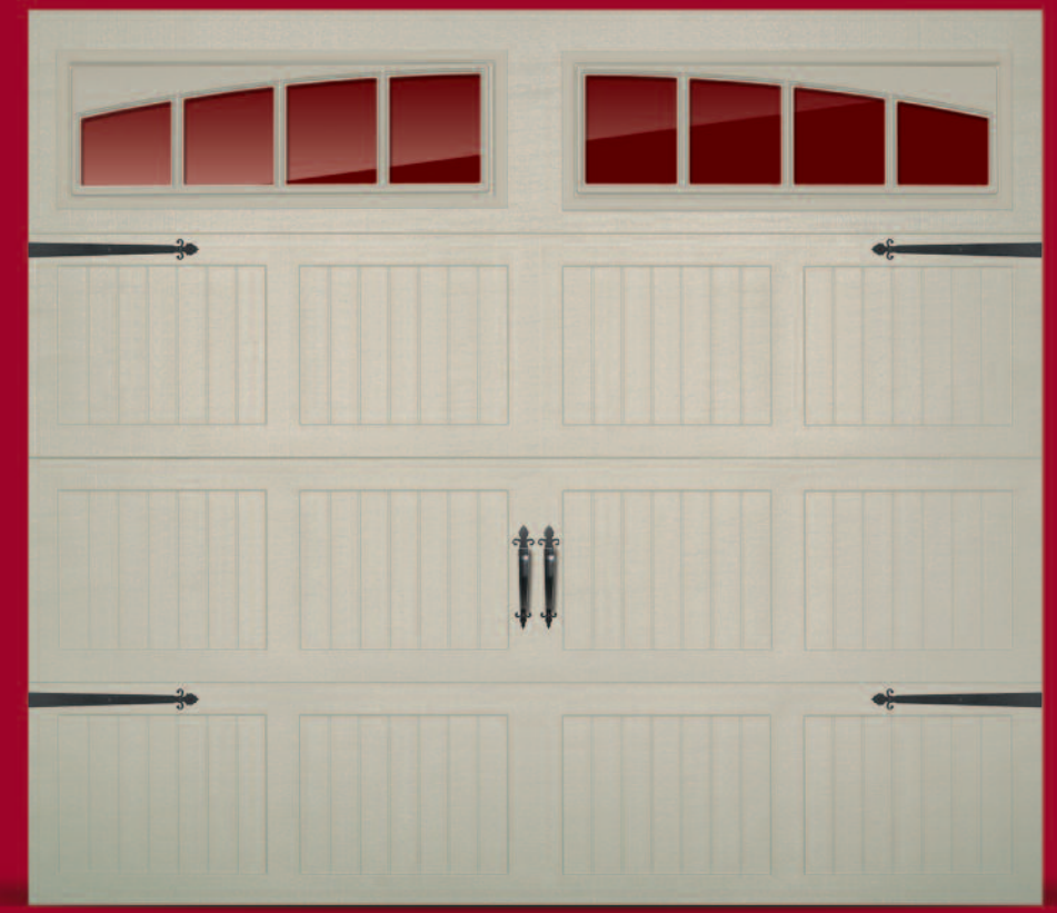
8' x 7' 5251 almond with optional arched madison inserts and barcelona 1 exterior hardware.