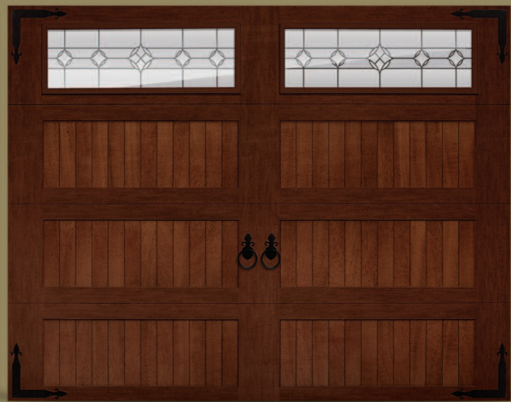
9' x 7' 5916 mahogany Accents woodtone with optional newport lites and barcelona 2 exterior hardware.